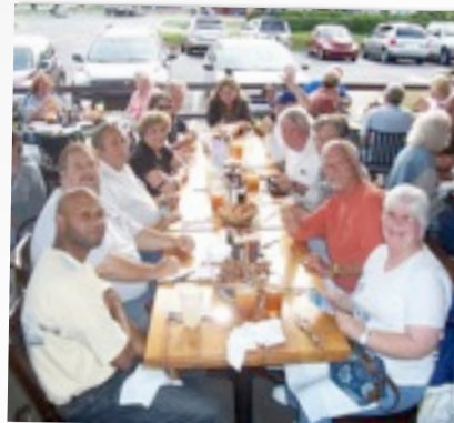
HELD AT JIM & NICK'S