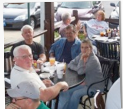
A GREAT TIME