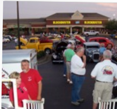
I RECOGNIZE THAT SHIRT!