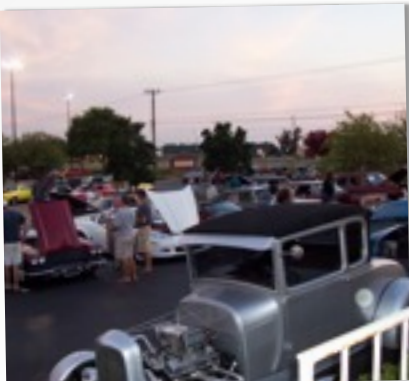
CRUISERS & CRUISEES!

Actually, the above picture of Gerald was from the June cruise-in, but it is so good, I just couldn't resist. Good ole Blue Bell!