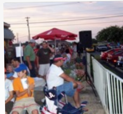
PEOPLE AND MORE PEOPLE!