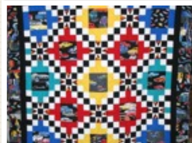
IT IS A WORK OF ART!