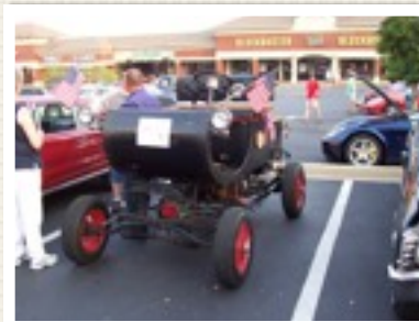
GUESS WHAT THIS IS?